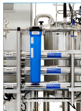
Continuous electro deionisation